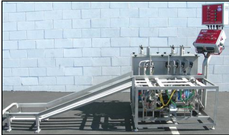
Mini King "Plus 2" (MKP2)

For Sankey - Single Valve Kegs (SVK's) for up to 35 kegs per hour