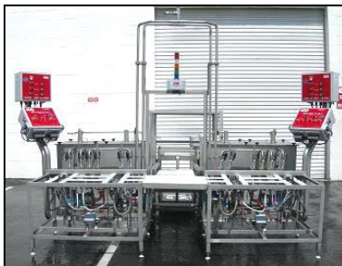
2 x MKP2 or MKS