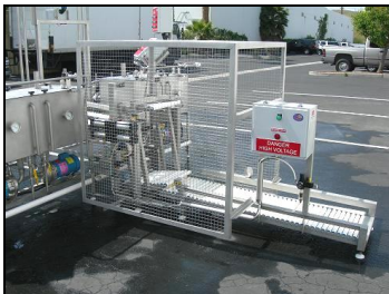
Descending Keg Turner